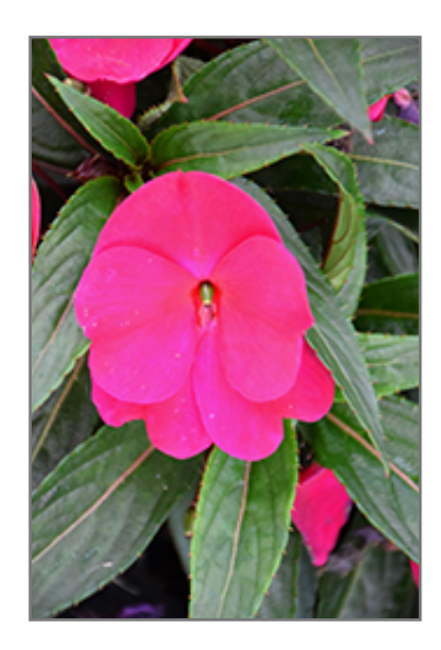
Sonic Deep Purple New Guinea Impatiens flowers

2301 San Joaquin Hills Rd. Corona del Mar, CA 92625 phone: 949.640.5800 www.rogersgardens.com