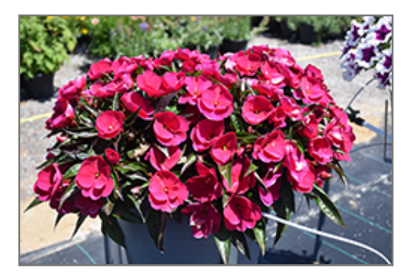
Sonic Deep Purple New Guinea Impatiens in bloom

Sonic Deep Purple New Guinea Impatiens will grow to be about 12 inches tall at maturity, with a spread of 12 inches. When grown in masses or used as a bedding plant, individual plants should be spaced approximately 10 inches apart. Its foliage tends to remain dense right to the ground, not requiring facer plants in front. This fast-growing annual will normally live for one full growing season, needing replacement the following year.