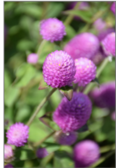
Ping Pong Lavender Globe Amaranth flowers

Ping Pong Lavender Globe Amaranth is recommended for the following landscape applications;