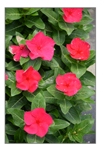
Cora XDR Punch flowers

Cora XDR Punch is recommended for the following landscape applications;