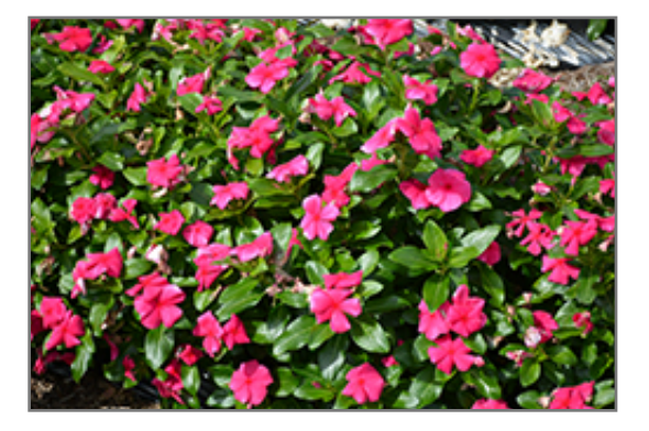
Cora XDR Punch in bloom

This plant does best in full sun to partial shade. It is very adaptable to both dry and moist locations, and should do just fine under typical garden conditions. It is not particular as to soil type or pH. It is highly tolerant of urban pollution and will even thrive in inner city environments. This is a selected variety of a species not originally from North America, and parts of it are known to be toxic to humans and animals, so care should be exercised in planting it around children and pets. It can be propagated by cuttings; however, as a cultivated variety, be aware that it may be subject to certain restrictions or prohibitions on propagation.