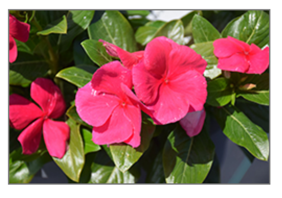
Cora XDR Punch flowers

A well branched, floriferous and disease resistant variety; large solid cherry red blooms are perfect for adding color to borders, containers, hanging baskets and rock gardens; heat and drought tolerant; no deadheading needed