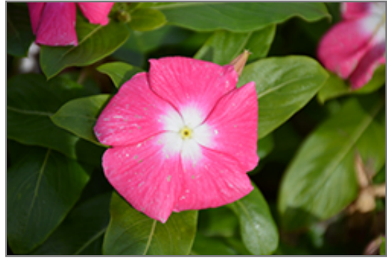
Cora XDR Pink Halo flowers

Cora XDR Pink Halo is recommended for the following landscape applications;