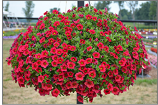
Lia Raspberry Calibrachoa in bloom