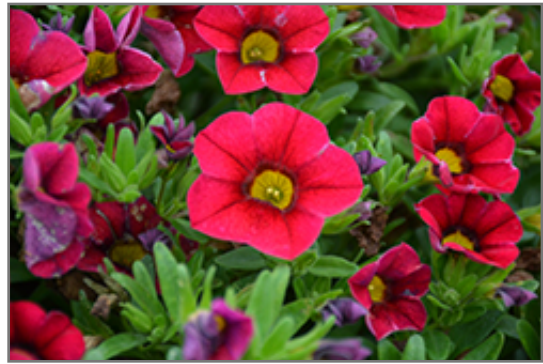
Lia Raspberry Calibrachoa flowers

Lia Raspberry Calibrachoa is a dense herbaceous annual with a trailing habit of growth, eventually spilling over the edges of hanging baskets and containers. Its medium texture blends into the garden, but can always be balanced by a couple of finer or coarser plants for an effective composition.