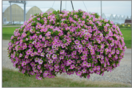
Chameleon Starlet Pink Calibrachoa in bloom