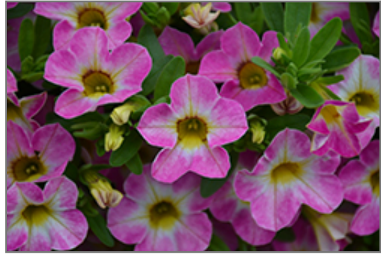
Chameleon Starlet Pink Calibrachoa flowers

Chameleon Starlet Pink Calibrachoa is a dense herbaceous annual with a trailing habit of growth, eventually spilling over the edges of hanging baskets and containers. Its medium texture blends into the garden, but can always be balanced by a couple of finer or coarser plants for an effective composition.