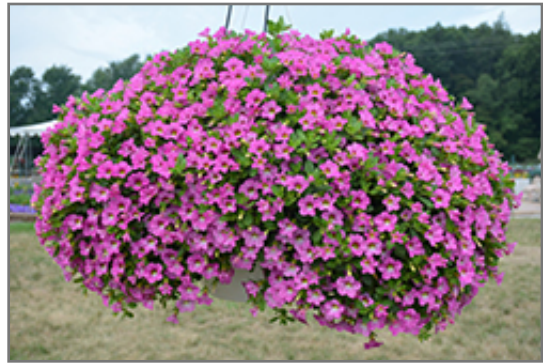
Chameleon Pink Diamond Calibrachoa in bloom