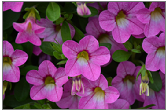
Chameleon Pink Diamond Calibrachoa flowers

Chameleon Pink Diamond Calibrachoa is a dense herbaceous annual with a trailing habit of growth, eventually spilling over the edges of hanging baskets and containers. Its medium texture blends into the garden, but can always be balanced by a couple of finer or coarser plants for an effective composition.