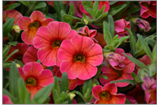
Chameleon Atomic Orange Calibrachoa flowers

Chameleon Atomic Orange Calibrachoa is a dense herbaceous annual with a trailing habit of growth, eventually spilling over the edges of hanging baskets and containers. Its medium texture blends into the garden, but can always be balanced by a couple of finer or coarser plants for an effective composition.