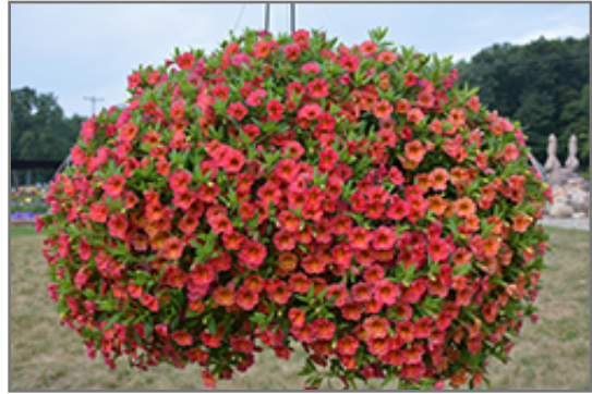
Chameleon Atomic Orange Calibrachoa in bloom