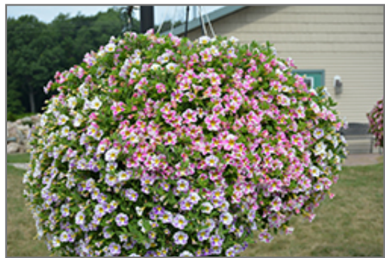
Candy Shop Pixie Stix Mix Calibrachoa in bloom