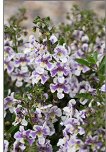
Alonia Bicolor Violet Angelonia flowers

Alonia Bicolor Violet Angelonia is recommended for the following landscape applications;