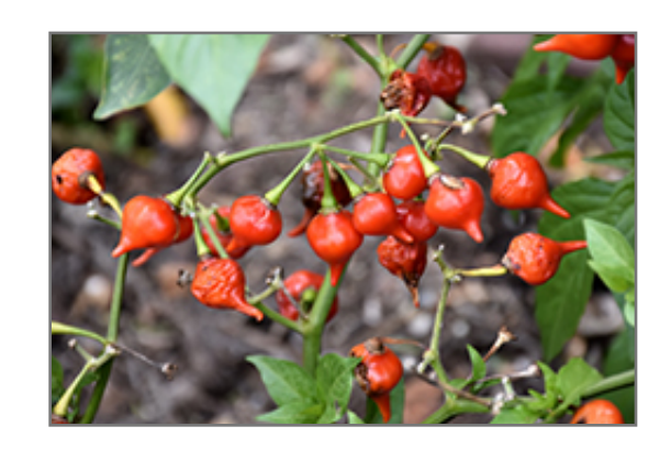
Australian Red Lantern Hot Pepper fruit

Australian Red Lantern Hot Pepper will grow to be about 3 feet tall at maturity, with a spread of 24 inches. When planted in rows, individual plants should be spaced approximately 24 inches apart. This vegetable plant is an annual, which means that it will grow for one season in your garden and then die after producing a crop.