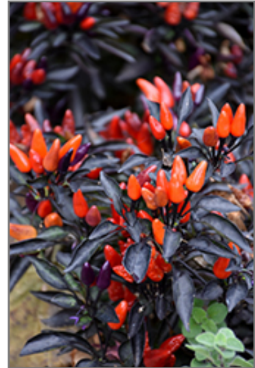
Explosive Ember Ornamental Pepper fruit

Explosive Ember Ornamental Pepper will grow to be about 18 inches tall at maturity, with a spread of 14 inches. When planted in rows, individual plants should be spaced approximately 14 inches apart. This vegetable plant is an annual, which means that it will grow for one season in your garden and then die after producing a crop.