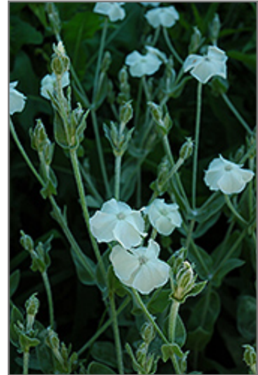
White Rose Campion flowers