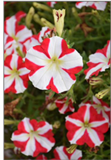
Amore King of Hearts Petunia flowers

Amore King of Hearts Petunia is recommended for the following landscape applications;