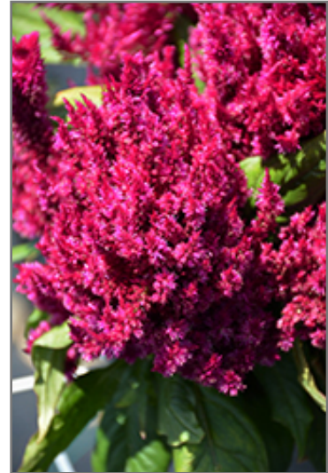
First Flame Purple Celosia flowers

First Flame Purple Celosia is recommended for the following landscape applications;