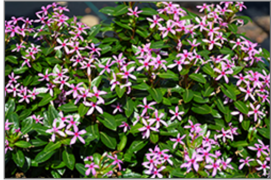
Soiree Kawaii Light Purple Vinca flowers

Soiree Kawaii Light Purple Vinca is recommended for the following landscape applications;