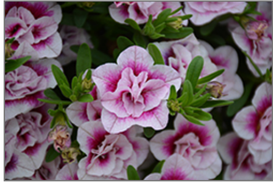
MiniFamous Uno Double PinkTastic Calibrachoa flowers

MiniFamous Uno Double PinkTastic Calibrachoa is a dense herbaceous annual with a trailing habit of growth, eventually spilling over the edges of hanging baskets and containers. Its medium texture blends into the garden, but can always be balanced by a couple of finer or coarser plants for an effective composition.