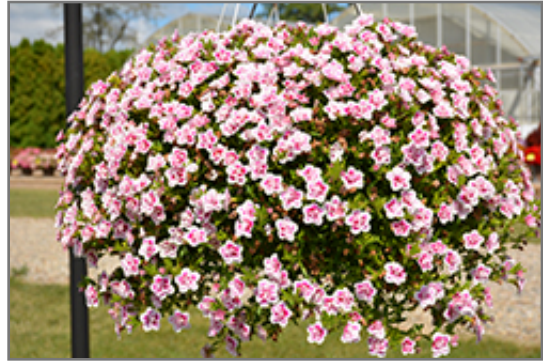
MiniFamous Uno Double PinkTastic Calibrachoa in bloom