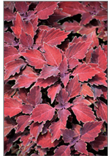
ColorBlaze Royale Cherry Brandy Coleus foliage

ColorBlaze Royale Cherry Brandy Coleus is recommended for the following landscape applications;