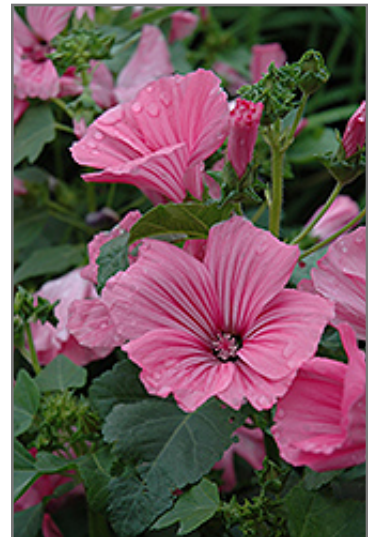
Novella Rose Lavatera flowers