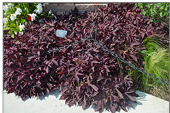
Sweet Caroline Red Hawk Sweet Potato Vine