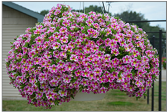
Superbells Holy Cow! Calibrachoa in bloom