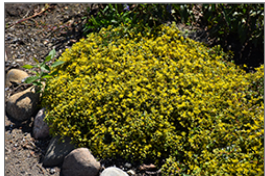
Rock 'N Low Yellow Brick Road Stonecrop in bloom