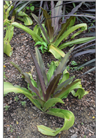
African Night Pineapple Lily

African Night Pineapple Lily is a fine choice for the garden, but it is also a good selection for planting in outdoor pots and containers. With its upright habit of growth, it is best suited for use as a 'thriller' in the 'spiller-thriller-filler' container combination; plant it near the center of the pot, surrounded by smaller plants and those that spill over the edges. It is even sizeable enough that it can be grown alone in a suitable container. Note that when growing plants in outdoor containers and baskets, they may require more frequent waterings than they would in the yard or garden.