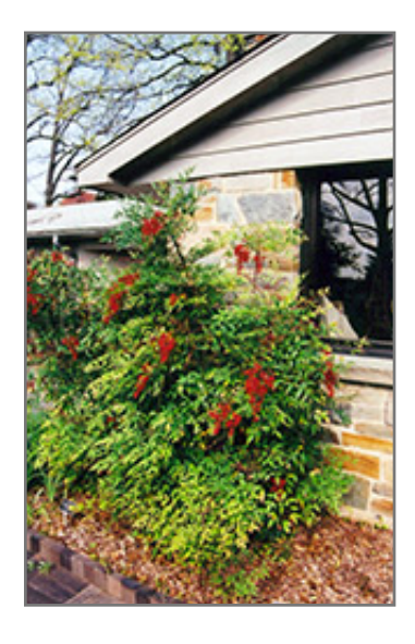
Nandina fruit

Nandina is recommended for the following landscape applications;