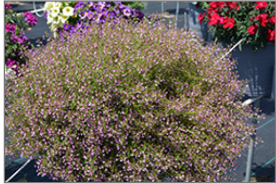
Pink Shimmer Cuphea in bloom

Pink Shimmer Cuphea will grow to be about 16 inches tall at maturity, with a spread of 16 inches. When grown in masses or used as a bedding plant, individual plants should be spaced approximately 12 inches apart. It tends to fill out right to the ground and therefore doesn't necessarily require facer plants in front. It grows at a medium rate, and under ideal conditions can be expected to live for approximately 10 years.