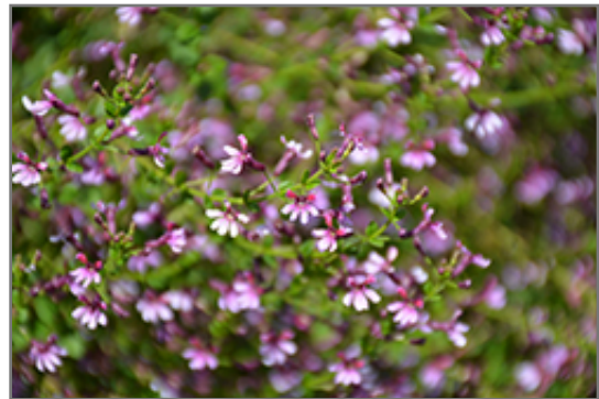
Pink Shimmer Cuphea flowers