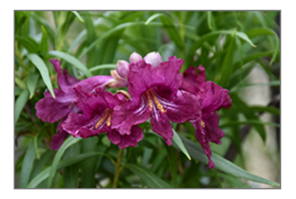
Burgundy Desert Willow flowers