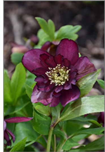
Wedding Party True Love Hellebore flowers