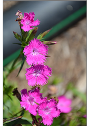
Rockin' Purple Pinks flowers

Rockin' Purple Pinks is recommended for the following landscape applications;