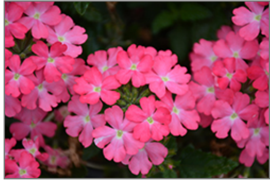
Firehouse Pink Verbena flowers

Firehouse Pink Verbena is recommended for the following landscape applications;