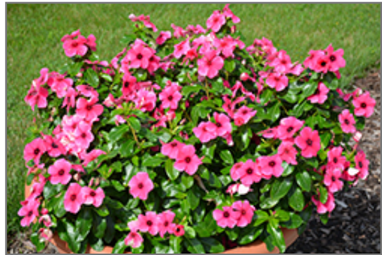
Tattoo Raspberry Vinca in bloom