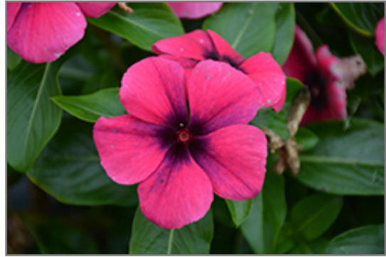
Tattoo Raspberry Vinca flowers

Tattoo Raspberry Vinca is a dense herbaceous evergreen perennial with a mounded form. Its medium texture blends into the garden, but can always be balanced by a couple of finer or coarser plants for an effective composition.