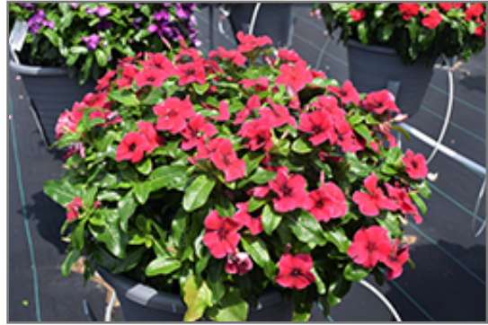
Tattoo Black Cherry Vinca in bloom