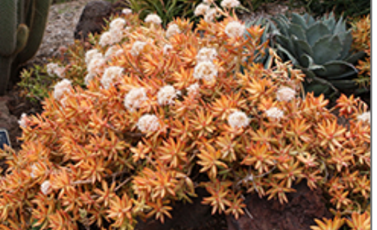
Firestorm Stonecrop in bloom

This plant will require occasional maintenance and upkeep, and is best cleaned up in early spring before it resumes active growth for the season. Deer don't particularly care for this plant and will usually leave it alone in favor of tastier treats. Gardeners should be aware of the following characteristic(s) that may warrant special consideration;