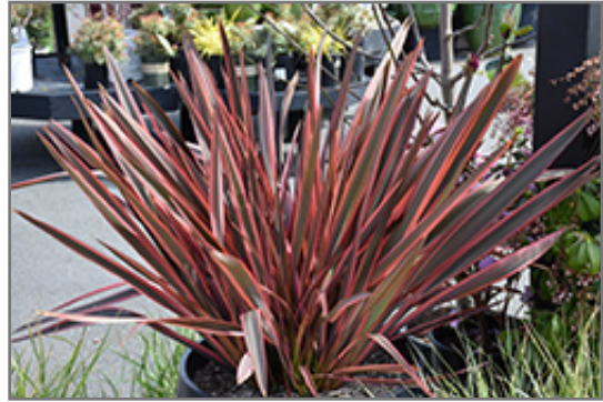
Rainbow Chief New Zealand Flax

Rainbow Chief New Zealand Flax is recommended for the following landscape applications;