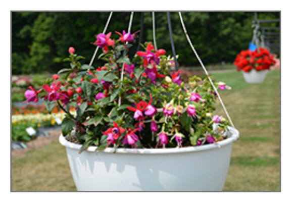
Bella Fuchsia Nora Fuchsia in bloom

2301 San Joaquin Hills Rd. Corona del Mar, CA 92625 phone: 949.640.5800 www.rogersgardens.com