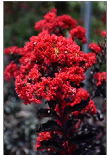
Black Diamond Best Red Crapemyrtle flowers

Black Diamond Best Red Crapemyrtle is recommended for the following landscape applications;