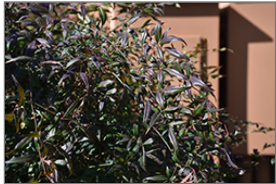
Plum Passion Nandina foliage