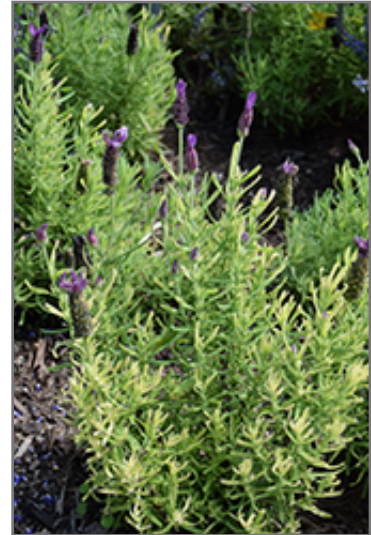
Javelin Forte Deep Purple Lavender in bloom

Javelin Forte Deep Purple Lavender makes a fine choice for the outdoor landscape, but it is also well-suited for use in outdoor pots and containers. It is often used as a 'filler' in the 'spiller-thriller-filler' container combination, providing a mass of flowers and foliage against which the thriller plants stand out. Note that when grown in a container, it may not perform exactly as indicated on the tag - this is to be expected. Also note that when growing plants in outdoor containers and baskets, they may require more frequent waterings than they would in the yard or garden.