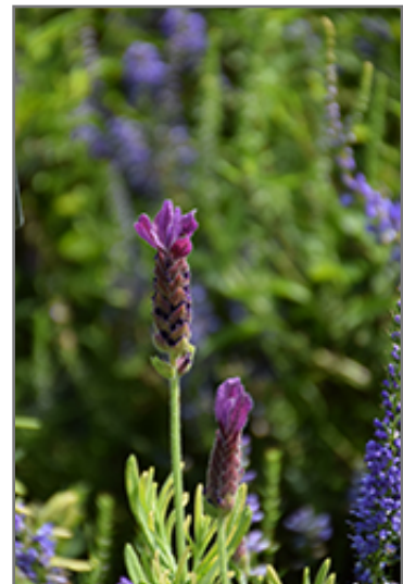
Javelin Forte Deep Purple Lavender flowers