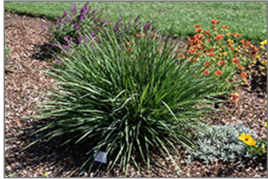
Coolvista Dianella

Coolvista Dianella will grow to be about 24 inches tall at maturity, with a spread of 24 inches. Its foliage tends to remain dense right to the ground, not requiring facer plants in front. It grows at a medium rate, and under ideal conditions can be expected to live for approximately 10 years. As an evergreen perennial, this plant will typically keep its form and foliage year-round.