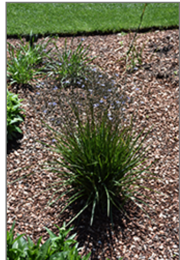
Coolvista Dianella in bloom