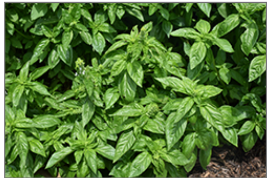
Romanesco Basil