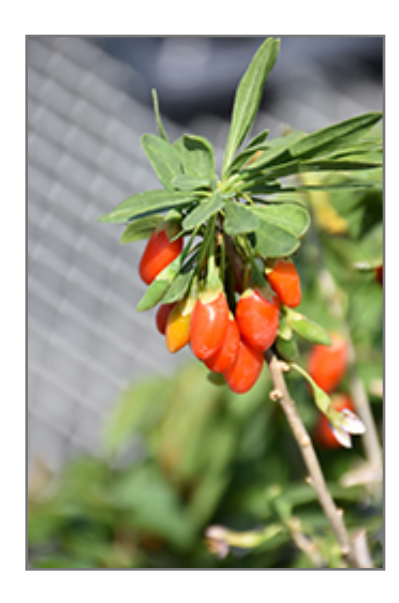
Firecracker Goji Berry flowers

Aside from its primary use as an edible, Firecracker Goji Berry is sutiable for the following landscape applications;