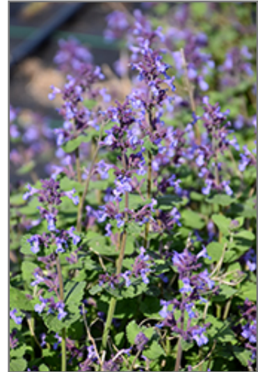
Aroma Violet Catmint flowers

Aroma Violet Catmint is recommended for the following landscape applications;