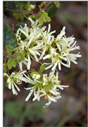
Snow Muffin Chinese Fringeflower flowers