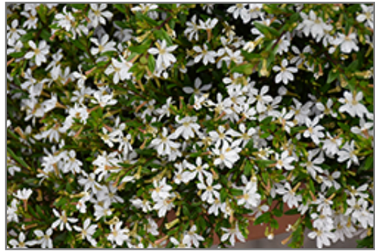
FloriGlory Maria Mexican Heather flowers

FloriGlory Maria Mexican Heather is recommended for the following landscape applications;