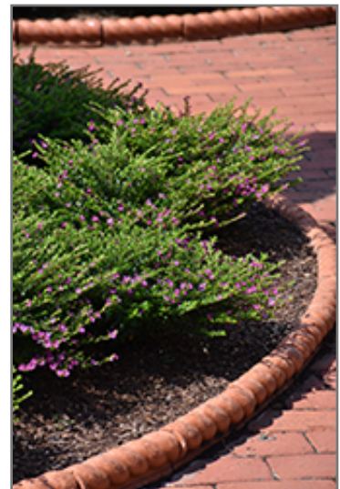
FloriGlory Diana Mexican Heather in bloom