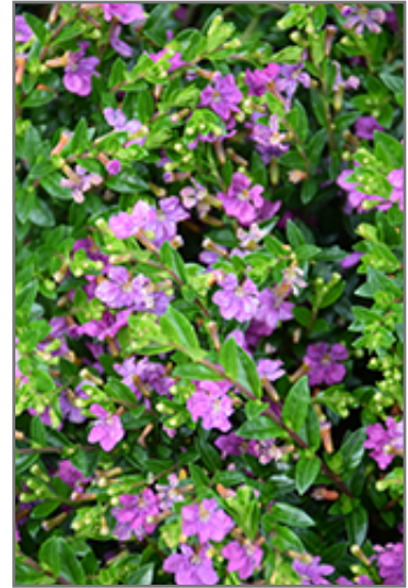
FloriGlory Diana Mexican Heather flowers

FloriGlory Diana Mexican Heather is recommended for the following landscape applications;