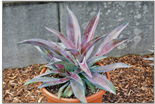
Mission to Mars Mangave

Mission to Mars Mangave will grow to be about 10 inches tall at maturity, with a spread of 22 inches. It grows at a fast rate, and under ideal conditions can be expected to live for approximately 5 years. As an herbaceous perennial, this plant will usually die back to the crown each winter, and will regrow from the base each spring. Be careful not to disturb the crown in late winter when it may not be readily seen!