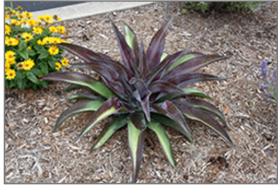
Mission to Mars Mangave

Mission to Mars Mangave is recommended for the following landscape applications;