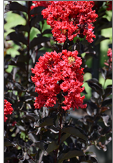
Ebony Fire Crapemyrtle flowers