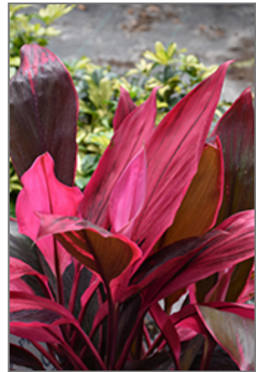
Red Sister Hawaiian Ti Plant foliage