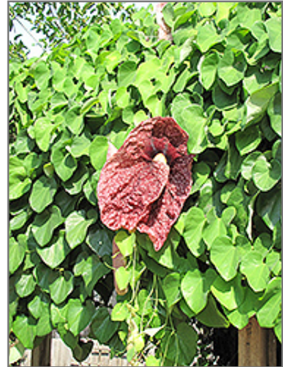
Giant Dutchman's Pipe flowers