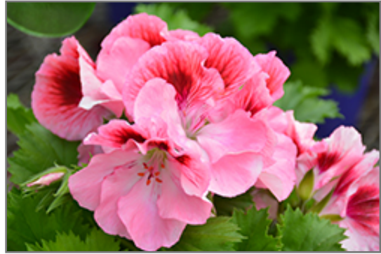
Elegance Ballet Geranium flowers

Elegance Ballet Geranium is recommended for the following landscape applications;