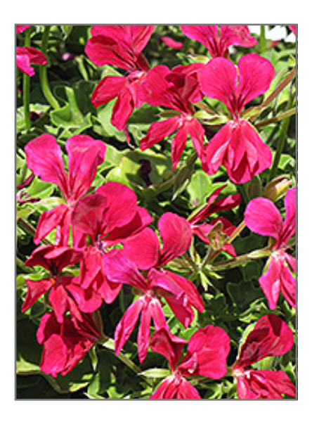
Blizzard Purple Ivy Leaf Geranium flowers

2301 San Joaquin Hills Rd. Corona del Mar, CA 92625 phone: 949.640.5800 www.rogersgardens.com